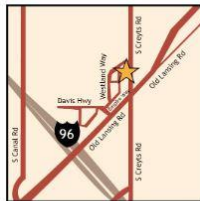
LANSING, MICHIGAN 4412 S. Creyts St. Lansing, MI 48917 Fax: 517-322-2805