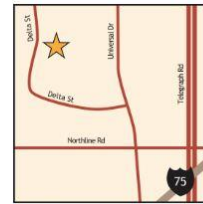
TAYLOR, MICHIGAN 12443 Delta Street Taylor, MI 48180 Fax: 734-403-2449