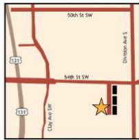
GRAND RAPIDS, MICHIGAN 122 54th St. Grand Rapids, MI 49548 Fax: 616-532-7574